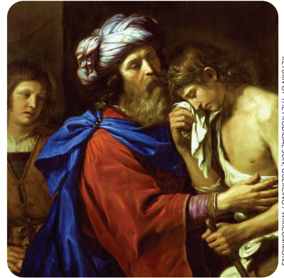
RETURN OF THE PRODIGAL SON, GUERCINO