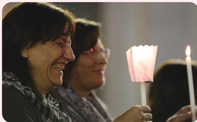
CATHOLIC NEWS AGENCY